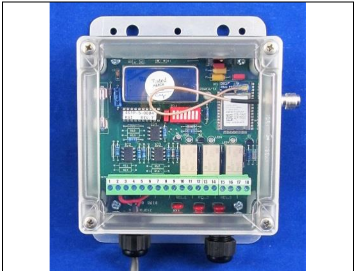
DC Powered Model Pictured