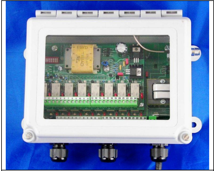
(AC Model Pictured)