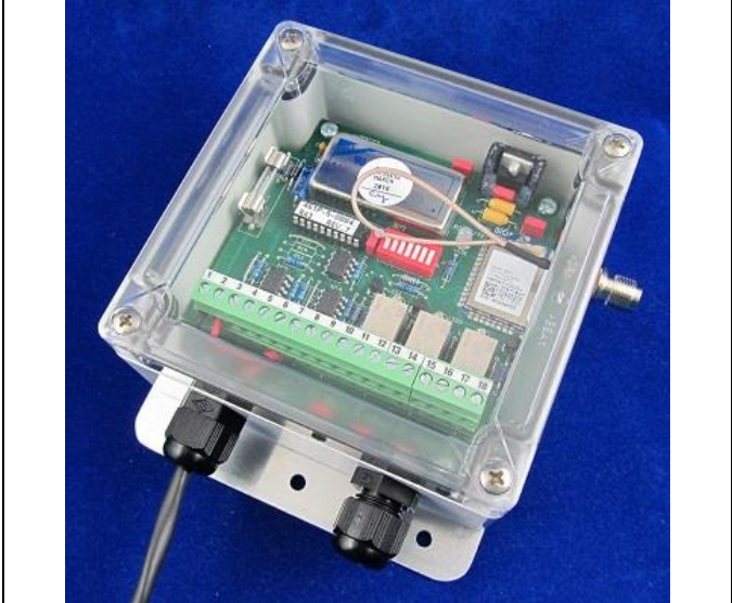
(DC Powered Model Pictured)