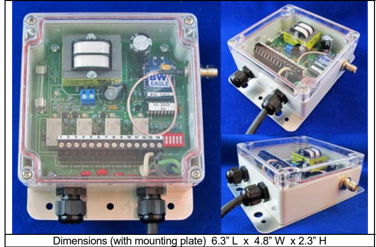
Dimensions (with mounting plate) 6.3" L x 4.8" W x 2.3" H

When power is applied to the receiver, all relays will be in their de-energized state. When power is applied to the E-stop transmitter, it immediately begins sending a beacon signal that causes all relays in the receiver to energize, indicating the communications link. Upon an E-stop command, the selected relays immediately de-energize. Upon specified link-loss time, the selected relays de-energize. The system will then need to be manually reset or will automatically come back online as designated by the system operation option selected.