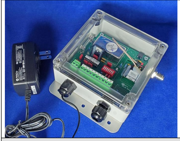
Dimensions (with mounting plate) 6.3" L x 4.8" W x 2.3" H