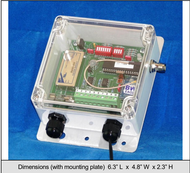
Dimensions (with mounting plate) 6.3" L x 4.8" W x 2.3" H

Transmission occurs when 120VAC is applied to the input. Transmission continues while 120VAC is present and ceases when 120VAC is removed.