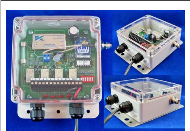
Dimensions (with mounting plate) 6.3" L x 4.8" W x 2.3" H