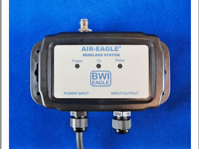
Dimensions (with mounting plate) 7.07L x 3.57W x 1.62H