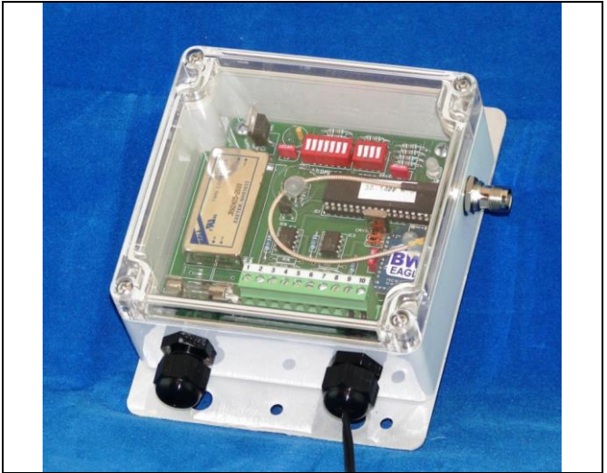
Dimensions (with mounting plate) 6.3" L x 4.8" W x 2.3" H