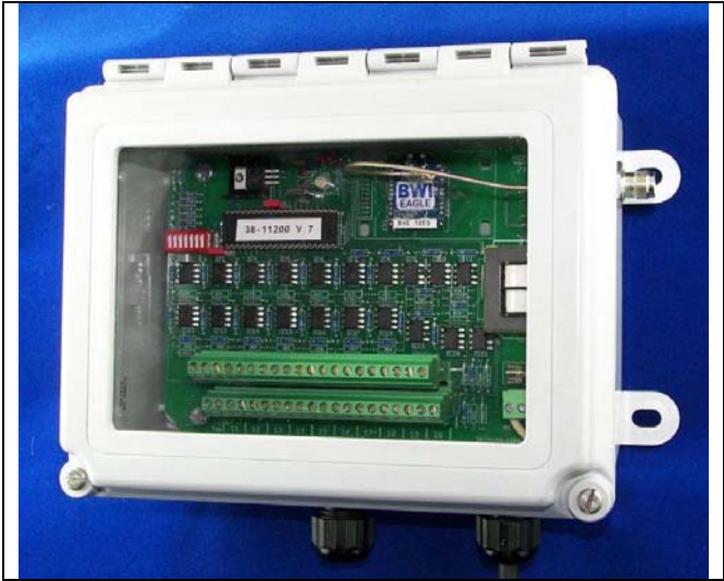
Dimensions 8" L x 6" W x 4" H