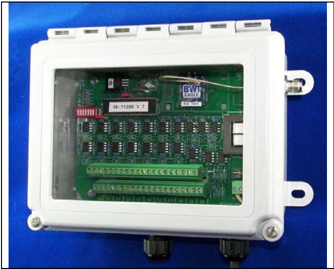
Dimensions 8" L x 6" W x 4" H