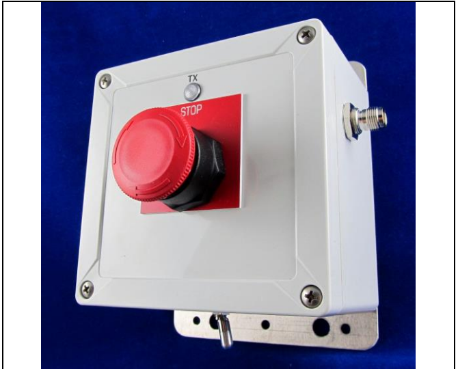
Dimensions (with mounting plate) 6.3" L x 4.8" W x 4.3" H