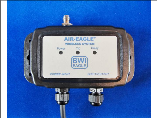
Dimensions (with mounting plate) 7.07L x 3.57W x 1.62H