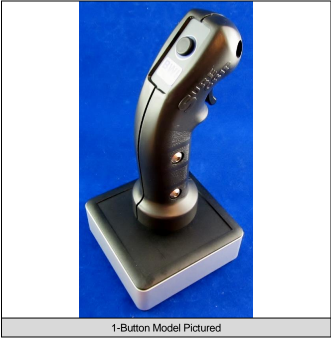
1-Button Model Pictured