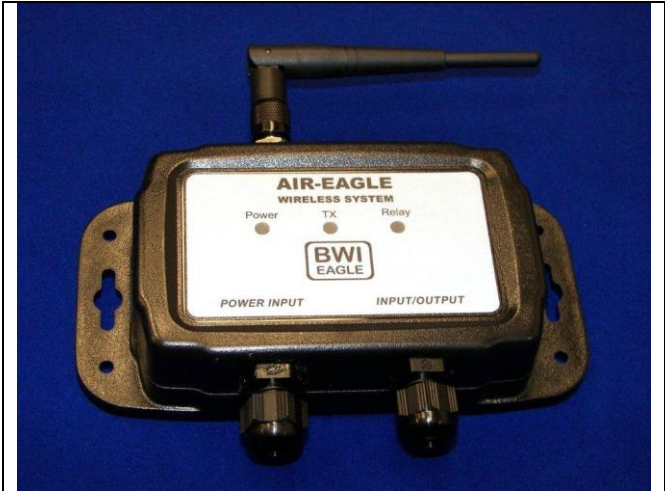
Dimensions (with mounting plate) 7.07L x 3.57W x 1.62H