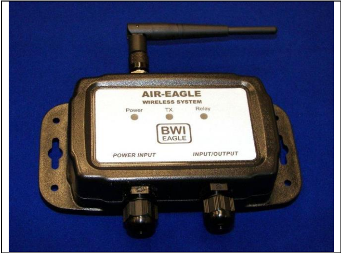
Dimensions (with mounting plate) 7.07L x 3.57W x 1.62H