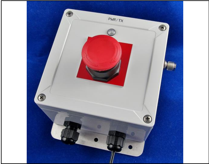
Dimensions (with mounting plate) 6.3" L x 4.8" W x 4.3" H