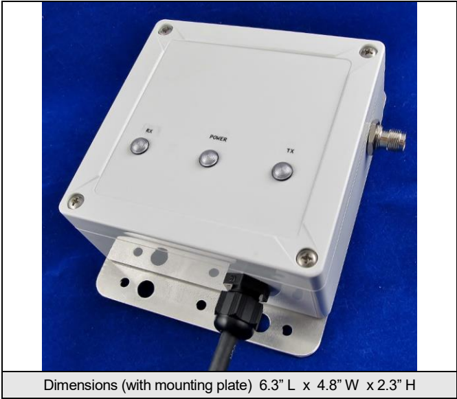
Dimensions (with mounting plate) 6.3" L x 4.8" W x 2.3" H