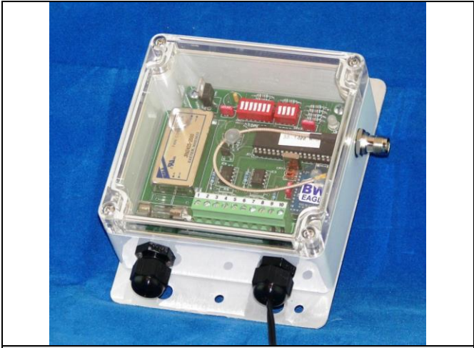
Dimensions (with mounting plate) 6.3" L x 4.8" W x 2.3" H