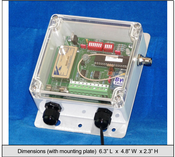
Dimensions (with mounting plate) 6.3" L x 4.8" W x 2.3" H

Transmission occurs when 120VAC is applied to the input. Transmission continues while 120VAC is present and ceases when 120VAC is removed.