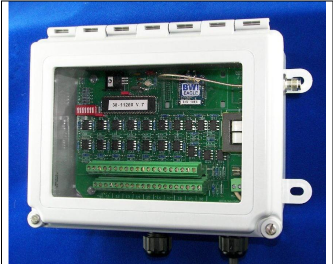
Dimensions 8" L x 6" W x 4" H