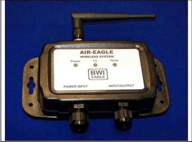
Dimensions (with mounting plate) 7.07L x 3.57W x 1.62H