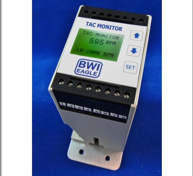
2.95" L x 2.19" W x 4.4" H