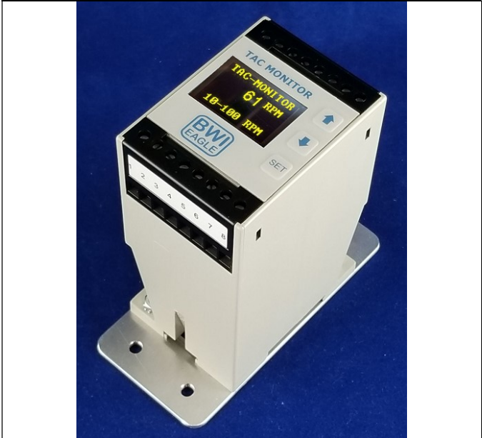
2.95" L x 2.19" W x 4.4" H